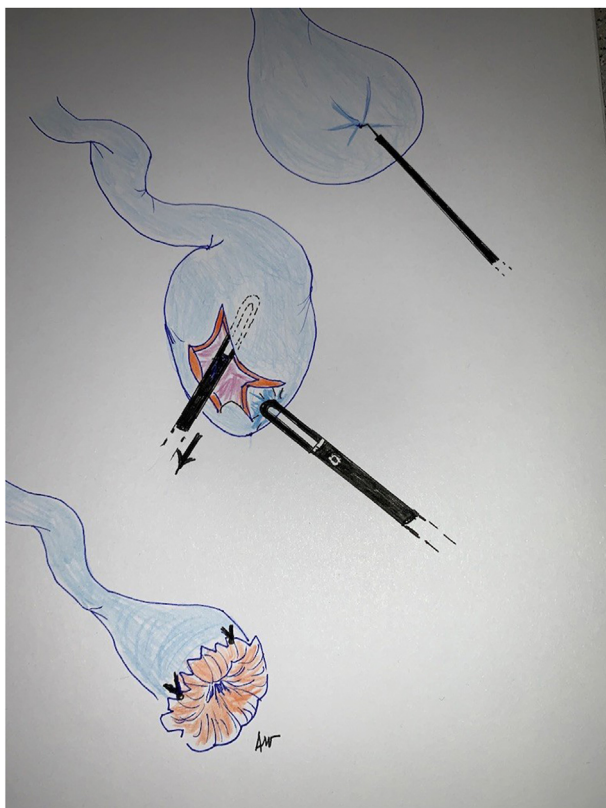
Fig. 3. Cuff salpingostomy.